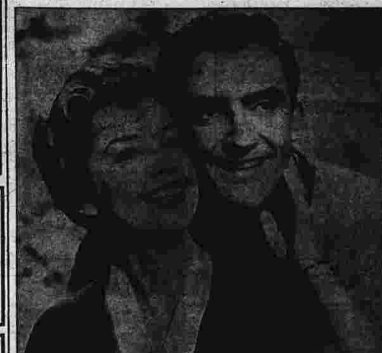
Yvonne Lime and Ronnie Burns

Henry Morgan of "I've Got a Secret" notes that, in this election year, political statements usually generate more heat than light!